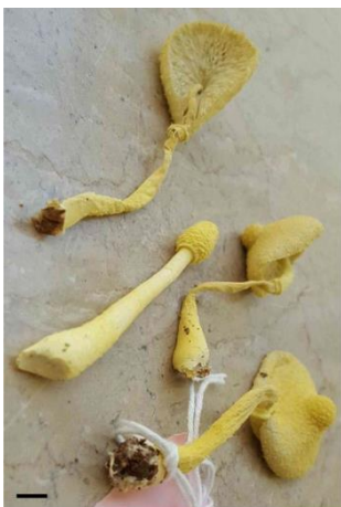
Figure 2: Basidiomata of Leucocoprinus birnbaumii UEH-F0001 showing its morphological features. Scale bars = 1 cm.

Basidiospores [60/3/1] (10)10.1–11.7(12) × (6.9)7.2–8.3(8.4) μm, Q (1.4)1.41–1.43(1.44), avQ = 1.42, ellipsoid, amygdaliform, thick walled, apiculate with a prominent germ pore, smooth, metachromatic. Basidia (18.3)18.5–23.7(24.6) × (9.1)9.3–14(14.5) μm, cylindrical to clavate, 4-spored, thin walled, hyaline. Pseudoparaphyses (14.7)16–17(17.5) × (12.2)12.5–