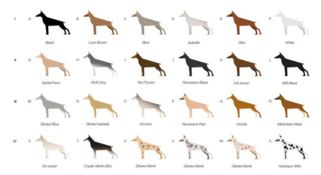
Figure 4: Schematic diagram of coat color diversity in dogs. (A-D) represent different shades of Eumelanin, (E) represents Phaeomelanin and (F) is White. (G-J) dog breeds are carrying Agouti gene (Locus A), and (K-L) dog species are examples of black coat color and brown coat color resulting from the (B Locus). (M-N) dog species have diluted coat color followed by (O-S) dog breeds carrying the (E Locus). (T-X) are dog breeds with different types of Merle and Harlequin patterns.