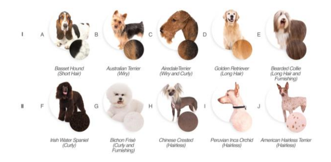
Figure 1: Combination of different alleles produce different coat texture. Dog (A) is an example of short hair phenotype, (B) have a wiry coat, (C) dog breed shows wiry and curly hair, (D) is an example of long hair coat, (E) shows long hair with characteristic furnishing, (F) is a standard curly coat, (G) represents furnishing on curly hair type, (H) have hairless torso with long hair on head, feet and tail, whereas, (I) is hairless with short hair on head, feet and tail, (J) is an example of hairless dog. (All individual dog pictures are taken from American Kennel Club <u>www.akc.org</u>).

Table 4: Combination of different alleles produce different coat phenotypes. FGF5 gene variants are responsible for long/short coat hair phenotype. RSP02 gene is associated with wiry hair and furnishings. KRT71 variants are seen in curly coat dog breeds. FOX13 and SGK3 , on the other hand are responsible for hairlessness in dogs.