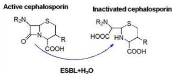
Figure 1: Inactivation of cephalosporin through hydrolysis of beta-lactam Ring by an ESBL [2].

ESBL+ bacteria hydrolyze the 4-ring beta-lactam ring thereby inactivating it and making it easier for their survival as shown below: