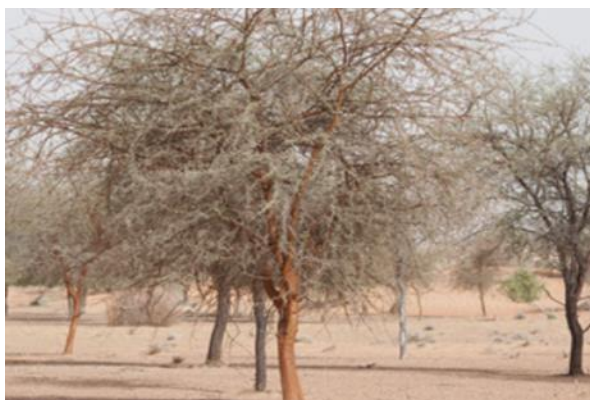
Figure 1: The tree of Acacia ehrenbergiana

Acacia ehrenbergiana , commonly known as salam is native to the hot and dry environment of the Arabian Peninsula. It's a tiny tree or tall shrub that seldom grows taller than 4 meters (13 feet) (Figure 1). It has many branches, a dark brown, hairy trunk, and green or brown stem with lustrous, peeling bark. Fujairah is the developing emirate of United Arab Emirates (UAE) with dry weather, rocky landscape, water scarcity and high salinity which makes most of the land nonarable. Being modestly salt tolerant, Acacia ehrenbergiana is suitable for the weather condition of Fujairah, hence is a native plant in UAE [1]. This plant can be found in abundance in desert area and in residential areas without external provision of water and mineral. It is an important legume fodder tree for indigenous populations and used to feed animals, such as goats, sheep, and camels. Its timber is used for charcoal and firewood. Acacia fiber's high concentration of soluble fiber is thought to provide several health advantages, including enhancing cardiovascular health, preventing diabetes, and reducing symptoms of irritable bowel syndrome (IBS). It has higher contents of minerals, vitamins, metals protein are useful carbohydrates.