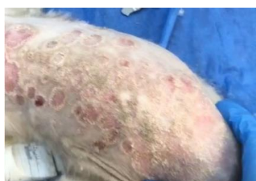
Figure 2: Feline ring worm.

Scabies Infection: Forty cases which form 20% of the total reported cases were undergo from scabies infection with appear a redness, rash and severe itching associated with blood from the skin and hair loss in a large way and may be crusted on the edges of the infection area especially the ear and ear edges. The laboratory examination revealed to the Notoedric cat (Feline Scabies) infection, in addition to the occurrence of large ulceration in the skin and a rise in temperature. The common site of infection in all body part, nose