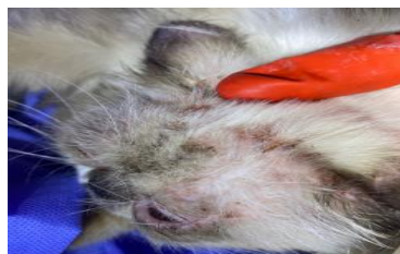
Figure 3: Feline Scabies in face with high crust.

and mouth this figure show infection received from hospital and private clinic figure (3) show these infections.