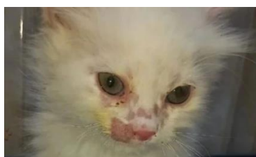
Figure 1: Fungal infection in nose of 6 months age cat.

The common site of infection in the ears, mouth, nose respectively may be in other site such as nose, face, and front legs. The figures 1, and 2 show the lesion in some animals undergo of fungal infection.