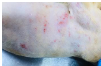
Figure 4: Completed Alopecia in cat.

Alopecia: According to the reported cases; 10 affected animals from Basrah private clinic which appear a severe hair loses in some body part when developed case which appear partial or complete alopecia which occur due to systemic disease or skin sensitivity or uncleaned and dirty places in Figure (4), there cases reported 5% of studied cases.