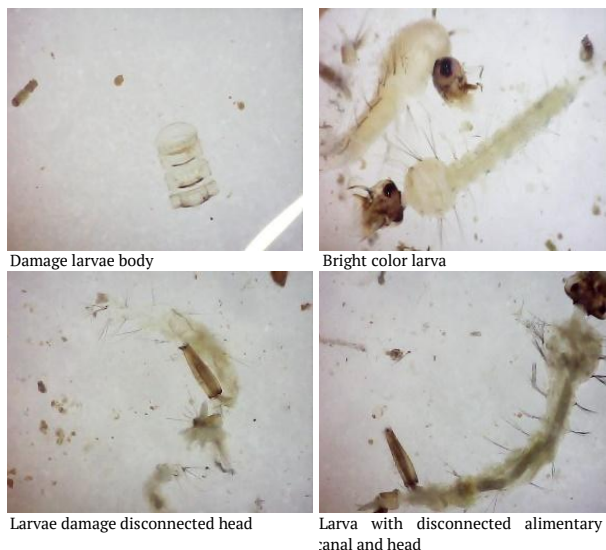
Figure 1: The damage caused by clove pods extract on Aedes aegypti mosquito larvae after 24 hour.

glycosides and alkaloids provides insight into their chemical makeup.