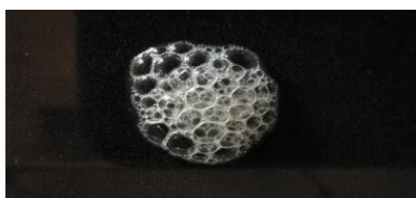
Figure 2: The appearance of air bubbles indicated the presence of S. aureus .