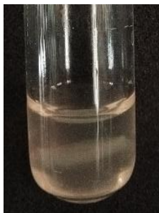
Figure 1: The coagulase test on S. aureus shows a positive reaction and looks cloudy.

the tube is tilted (Figure 1). A catalase test was performed by adding 3% hydrogen peroxide (H 2 O 2 ) to bacterial colonies on glass slides. The appearance of air bubbles indicated the presence of S. aureus (Figure 2).